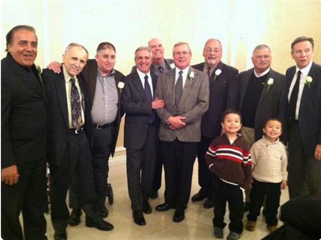
2013 The Ambrose "Boys"